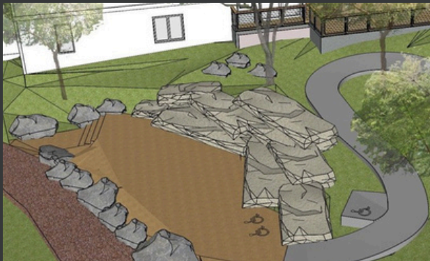
Below: Accessible paths and amphitheater concept.