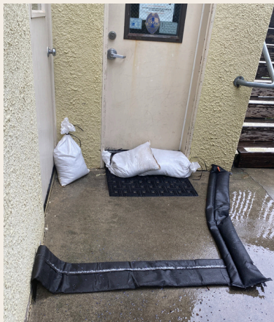
Lower-level water intrusion and temporary prevention response.

Our building's foundation will be repaired, and electrical, HVAC, plumbing, air filtration, and fire suppression will be updated. Improvements to the park will enhance pathways and refresh the Garden Learning Center.