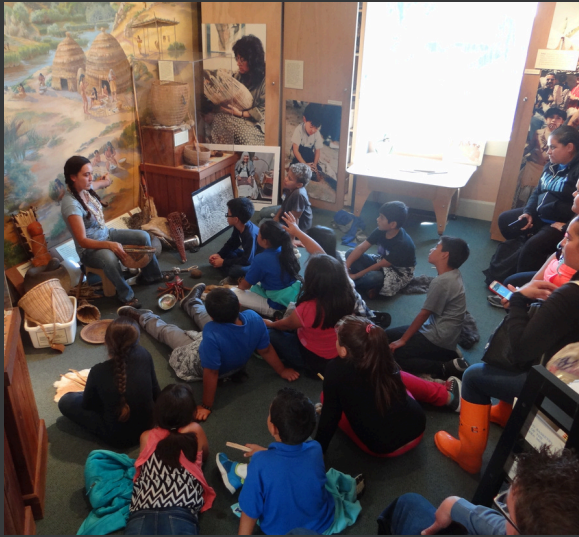
Above: Inaccessible exhibit during school program.