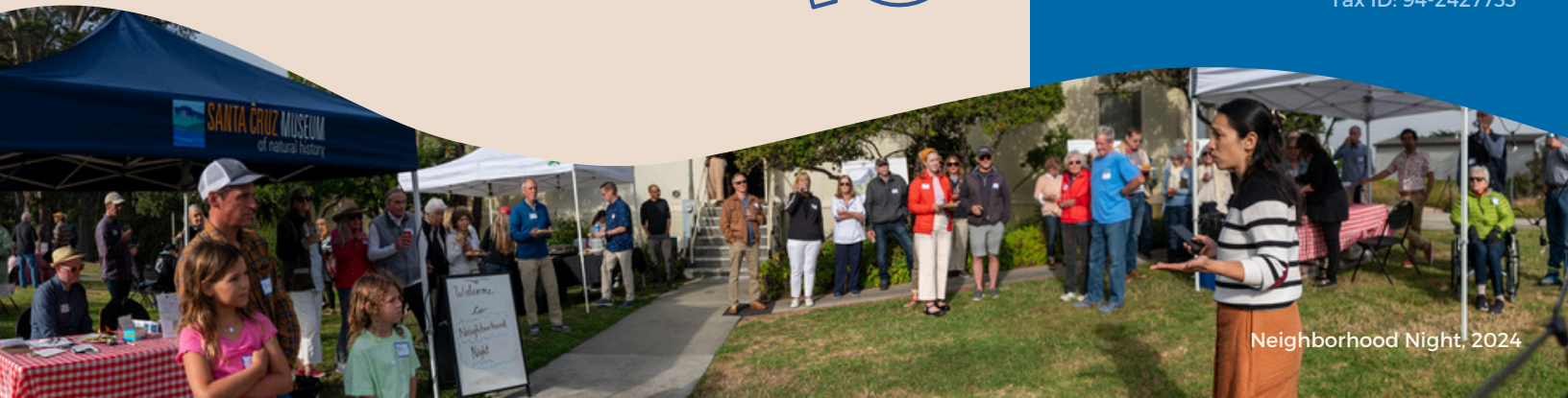
Neighborhood Night, 2024